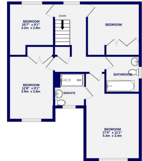
1ST FLOOR 685 sq.ft. (63.7 sq.m.) approx.